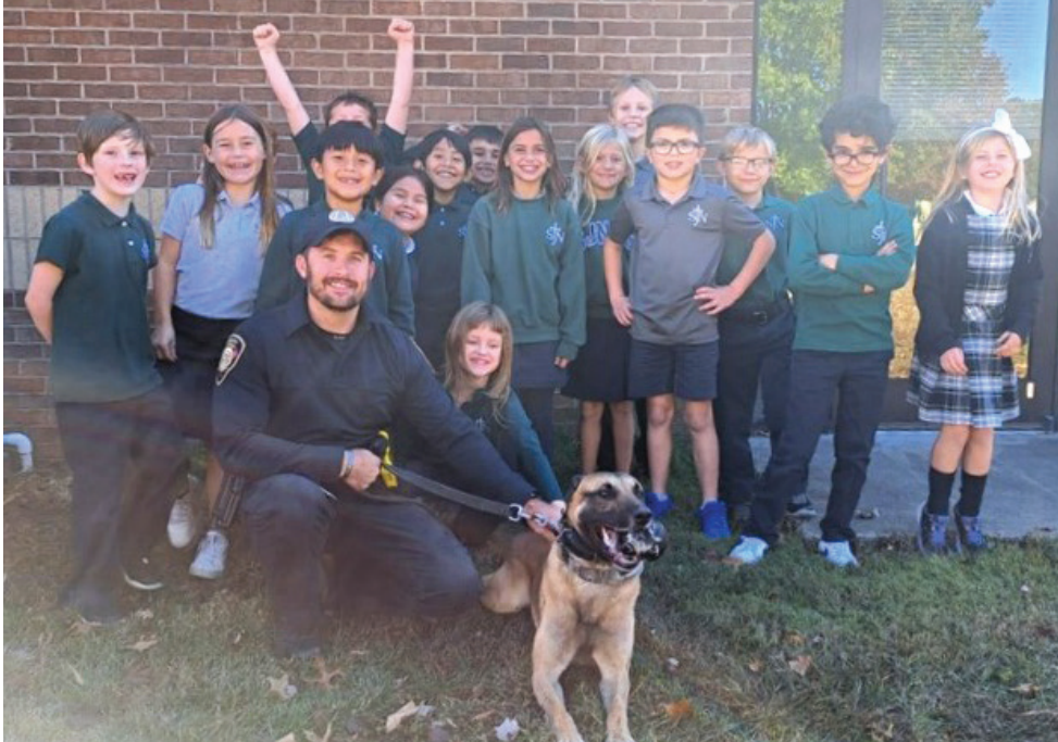
Annual Fund gifts help make it possible for us to have a full-time officer on-site from the Knox County Sheriff's Office.