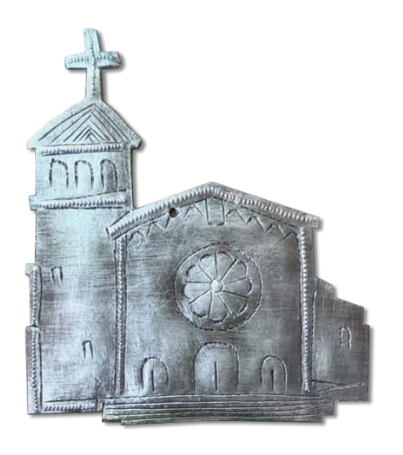
SJN Ornament Promo! See inside for details

625 ST. JOHN COURT • KNOXVILLE, TN 37934